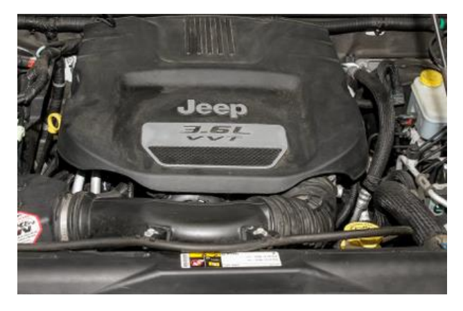
Figure 2: Jeep Wrangler Engine Cover

Even though the engine bays of vehicles have been filled to capacity with essential equipment, the basic operating fundamentals of monitoring temperatures and providing lubrication cannot be ignored.