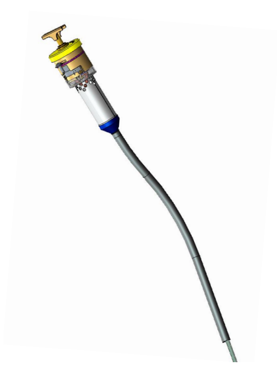
Figure 3: Dual Function Level Sensor

also allows users to manually check fluid levels in the normal fashion.