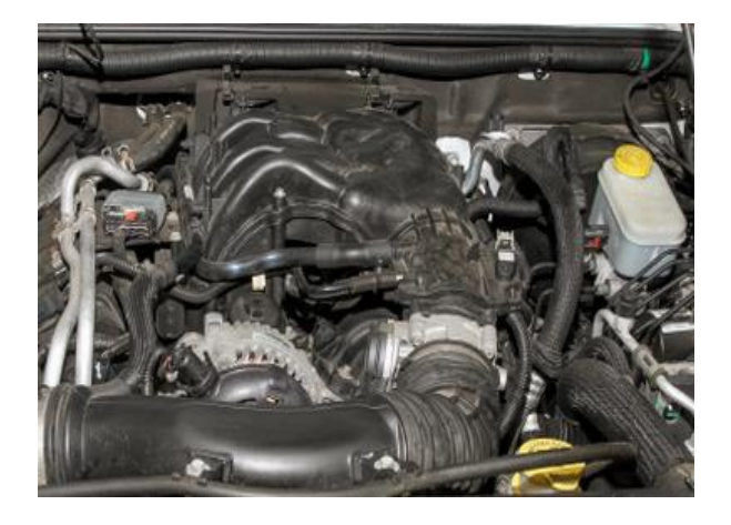
Figure 1: Jeep Wrangler 3.6 L Engine Compartment

emissions, provide comfort to the occupants, cool the engine, and containers to store fluids. Traditionally, the first indication of a fluid leak has been a spot of oil on the garage floor. This is later traced back to its source, and the leak is fixed. For military vehicles this is not possible due to armor over and under the powerpack, which obscures the leak until more serious symptoms start to occur. Even in non-military vehicles, tracing a leak back to its source could entail taking apart most of the engine. The congestion under the hood also acts as a deterrent to regularly checking the oil level. Figure 1 shows the typical congestion in modern engine compartments.